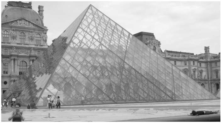
The Louvre in Paris, France